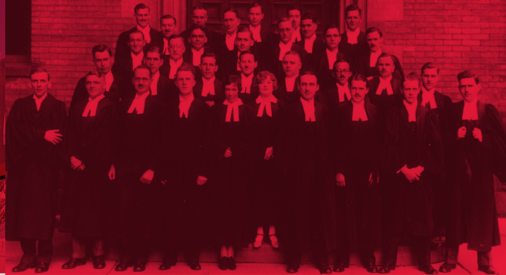
Class of 1929 Call to the Bar

We'd love to tell you more about Osgoode. To speak with current students and learn more about living and studying at Osgoode, contact recruitment@osgoode.yorku.ca . Or connect with us at one of our fall admission events which are posted on our website.